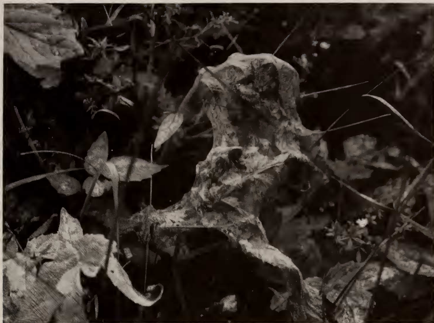
Fig. 4. A Valeriana sambucifolia plant that has been fed on by a group of 2nd instar M. diamina larvae. The silk spun by the larvae is fairly inconspicuous, but the upper epidermis left uneaten by the larvae becomes conspicuous when it dries.